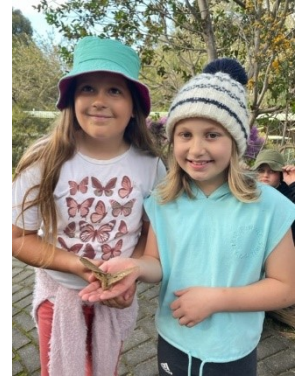
The web of life game—Ila